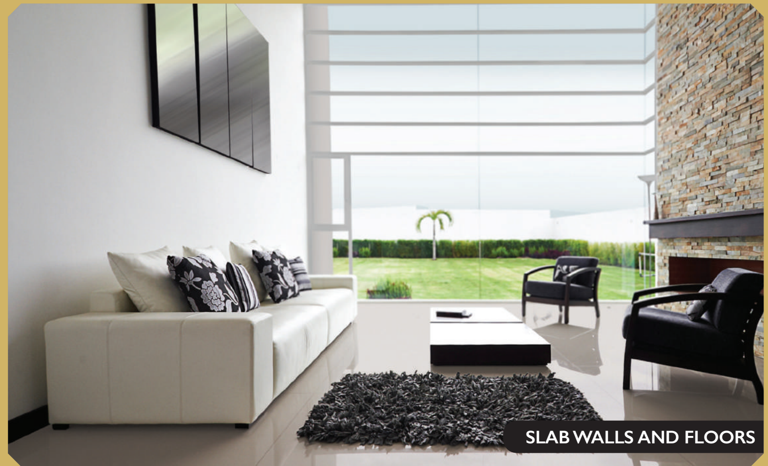
SLAB WALLS AND FLOORS