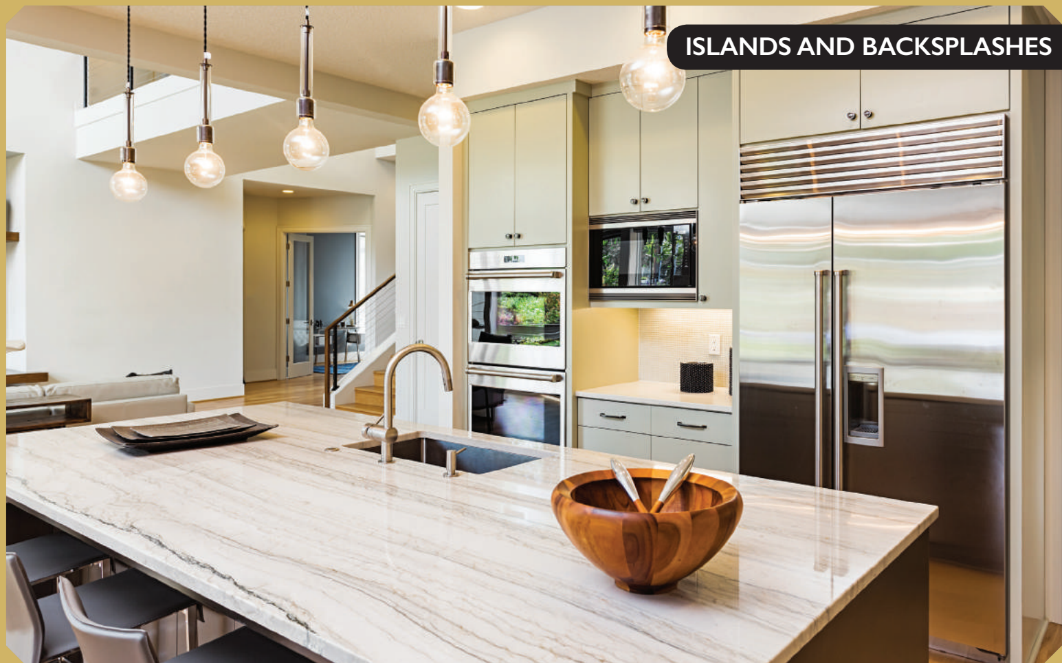
ISLANDS AND BACKSPASHES