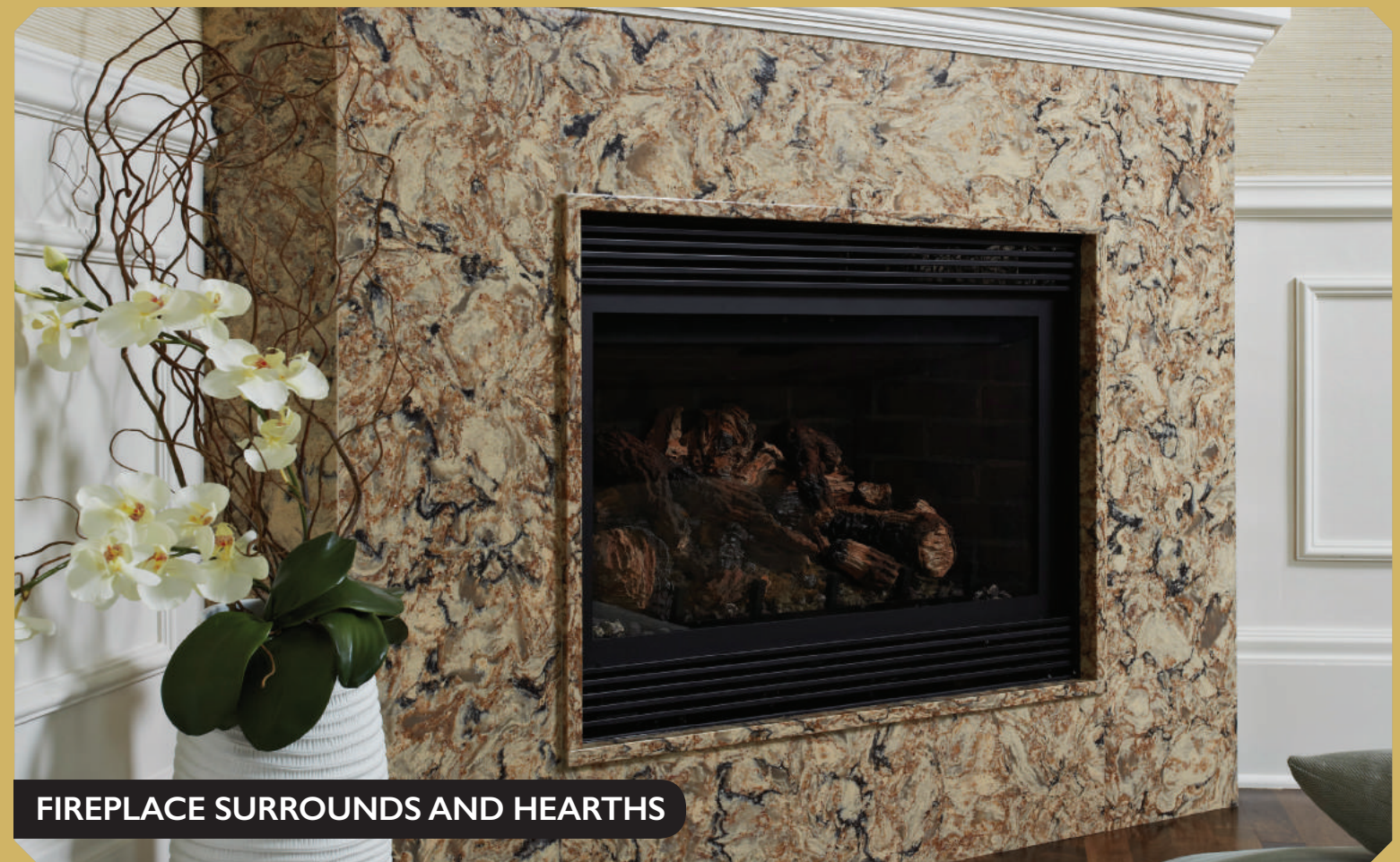
FIREPLACE SURROUNDS AND HEARTHIS